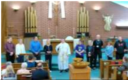
Commissioning the volunteers on May 3 rd