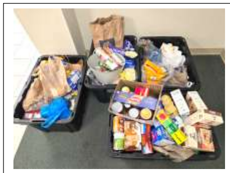
4 Overflowing bins of donated food