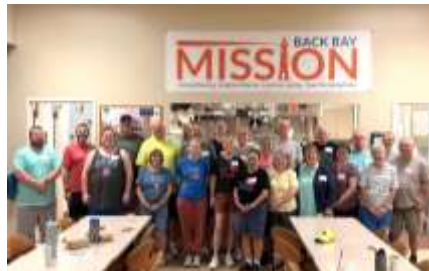
Our team along with volunteers from Holy Trinity Lutheran in Muncie, IN